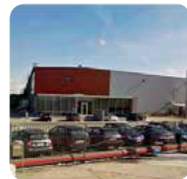
MAIN PRODUCTION packing of herbs, prepared vegetables