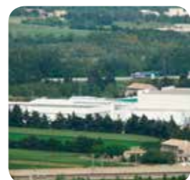
MAIN PRODUCTION Mediterranean herbs