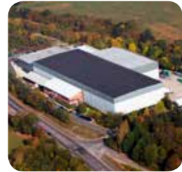
MAIN PRODUCTION packing and distribution site