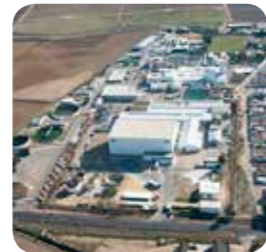
MAIN PRODUCTION fried & grilled vegetables, cherry & date tomatoes, olives