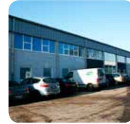
MAIN PRODUCTION peas, sauces, butter portions