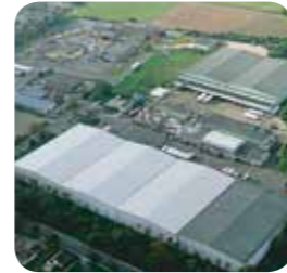
MAIN PRODUCTION peas