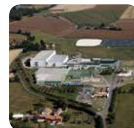
MAIN PRODUCTION sweetcorn, peas, beans