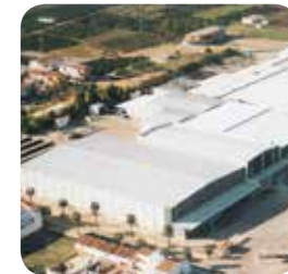
MAIN PRODUCTION sweetcorn, peas, spinach, broccoli, pepper, turnip leaves, rice, sauces, prepared vegetables