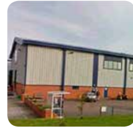
MAIN PRODUCTION herbs: parsley, chives, mint, cress, coriander..., packing of smoothies, fruit