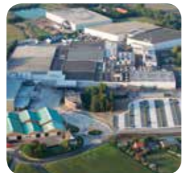
MAIN PRODUCTION cauliflower, peas, beans, endive, root vegetables, cabbage, leek, courgettes, celery, rhubarb