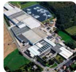
MAIN PRODUCTION spinach, peas, beans, Brussels sprouts, root vegetables, sugar snap peas, rice, pasta, potatoes, pulses