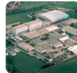
MAIN PRODUCTION peas, beans, cabbage, spinach, root vegetables, butternut squash, soybeans, prepared vegetables, fried vegetables