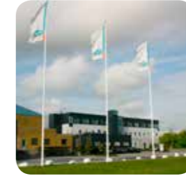
MAIN PRODUCTION distribution site