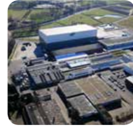
MAIN PRODUCTION spinach, cabbage, curly kale, prepared vegetables