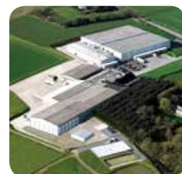
MAIN PRODUCTION herbs: parsley, chives, mint, cress, coriander,...