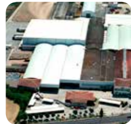
MAIN PRODUCTION distribution site