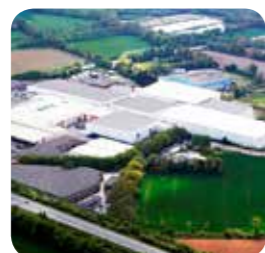
MAIN PRODUCTION spinach, peas, beans, cauliflower, root vegetables, broccoli, purees, prepared vegetables, soups