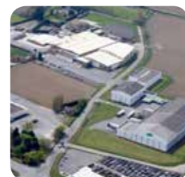
MAIN PRODUCTION natural & fried onions, peas, bean-sprouts, fried vegetables