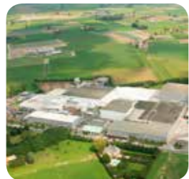
MAIN PRODUCTION peas, beans, root vegetables, spinach, Brussels sprouts, cauliflower, celeriac